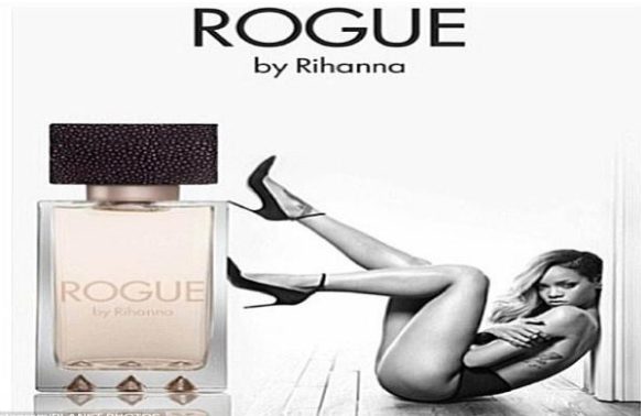
Fig. 5.1 Cosmopolitan Magazine Fig.5.2 Cosmopolitan Magazine