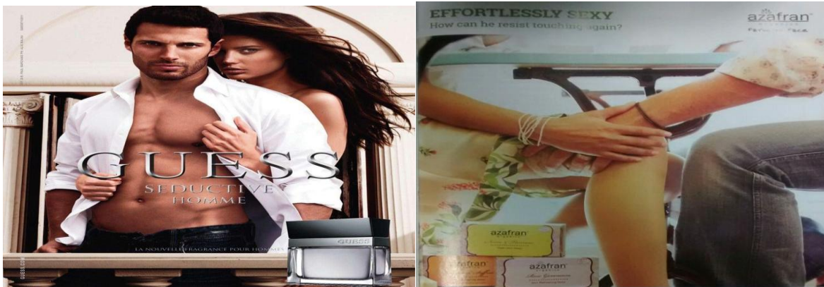
Fig. 2.1 Cosmopolitan Fig. 2.2 Femina