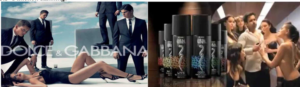
Fig.3.1 Cosmopolitan Fig.3.2 Femina